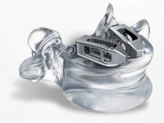
Inner wall surface